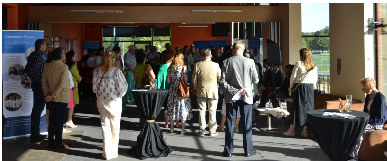
Guests gather round to hear from our student panel at the Donor Impact Drinks Reception

and compassion; the bursary recipients whose lives have been transformed through the gift of education; the young musicians who have opportunities they might never have even considered previously, thanks to philanthropy; or the young men and women whose student experience was shaped by the inspirational facilities they have been able to study in, thanks to people like you. None of those stories would have happened without each and every one of our generous donors. Whether you have given £10, £10,000 or even more, your gift will make a difference to future generations of Foundation students, and we are so grateful to you all for your support. Thank you.